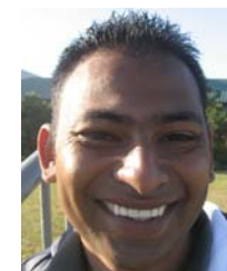
Zain, South Africa