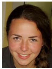
Asia, U of Calgary