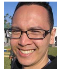
Carlos, British Columbia