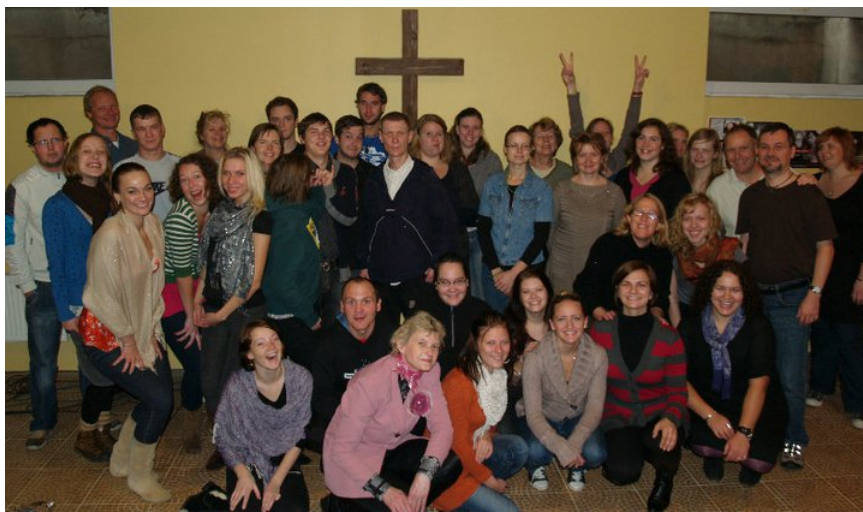
▲ The 50 attendees, from 13 countries, of the Oct. 18-22 YWAM School of Prophetic Justice in Riga, Latvia. I gave three 2-hour presentations on abortion!

It is because of you standing with us, financially backing our endeavors, that we can reach so many—and train those we reach, to reach others. So thank you. We hope you will be encouraged by the good fruits below, and by our growth for 2011. And we hope that you will write the biggest cheque possible this Christmas to help us end this massacre of innocents.