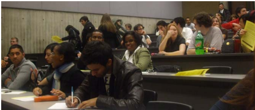
Over 140 attended the rescheduled York debate.

Of course not everyone was positive. Angry pro-abortion students called me names and one older woman insisted